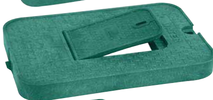
3. 1015-3G COVER WITH METER DOOR